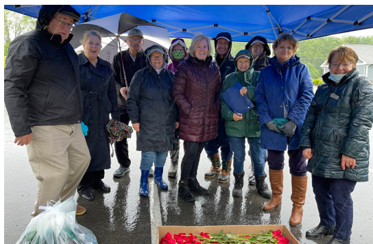
Volunteers gather on Memorial Day weekend to place roses on the graves of those who served at the NJ Veterans Cemetery.

Karen Ann Quinlan Hospice is a Level 5 - "We Honor Veterans" partner. Level 5 is the highest level achievable and Karen Ann Quinlan Hospice is the only hospice in the state of New Jersey to achieve this recognition. In order to retain the Level 5 designation the organization